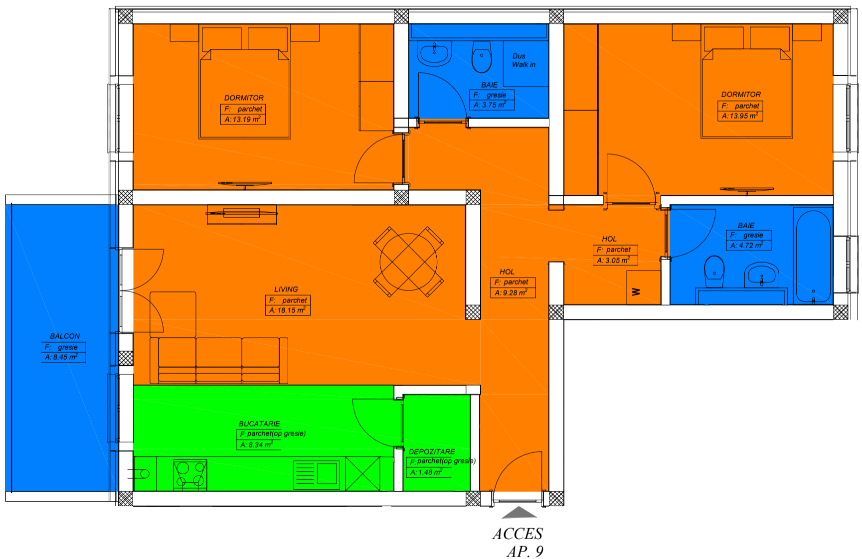
Plan AP. 9, scara 1:50